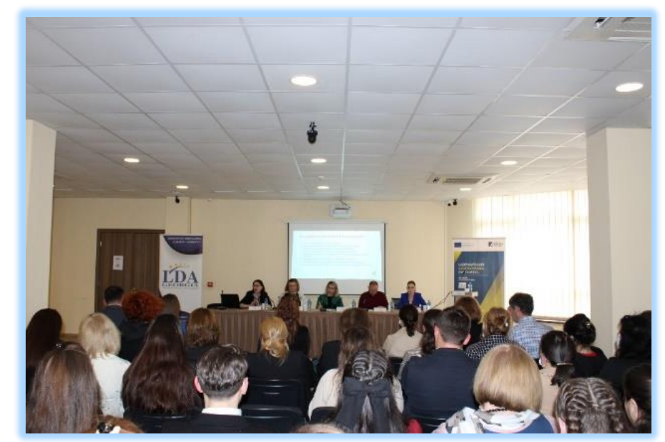
project, Imereti Regional Hub held 4 public meetings and gave public consultations at the regional level. The purpose of the meeting was to discuss important issues with the involvement of relevant actors at the regional level.