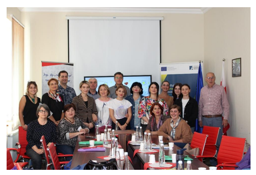
Ambrolauri - Job shadowing

Within the framework of the project, Imereti Regional Hub organized study visits/job shadowing for CSO's/CBO's representatives in Zugdidi and Guria municipalities. The purpose of this activity was to gain experience and share successful examples, as well as to share the possibility of cooperation between CSOs/CBOs in the bordering regions. A total of 6 meetings have been held.