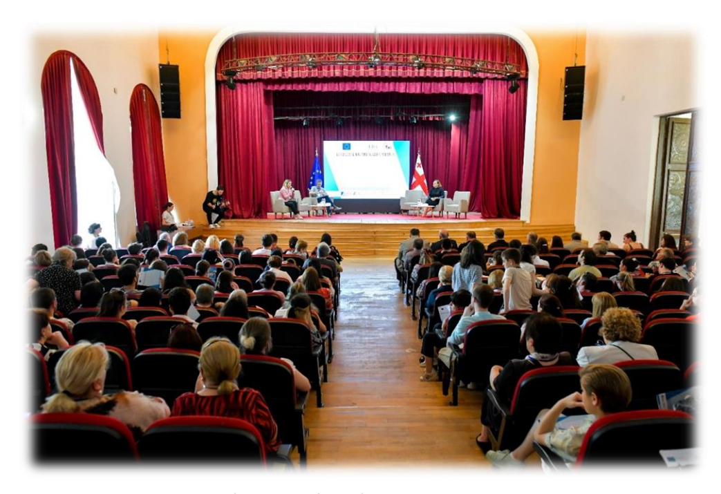
Regional Forum of Civil Society, Imereti region

The regional hub of Imereti within the framework of the project created an SMS platform, the purpose of which is to provide information to the CSO's and CBO's representatives of the region about various events planned at the regional or national level. The platform is located in the organization's web page. The activity supports sectoral cooperation and the opportunity to engage in various networks.