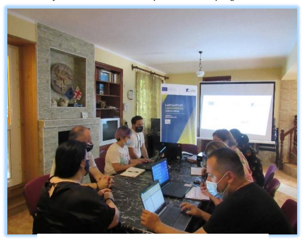
Tskaltubo - Consultation meeting

Imereti regional hub held meetings with persons responsible for relations with