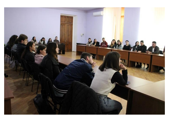
organization and become members of the club.

Local Democracy Agency Georgia (LDA Georgia) held an Open Door Day for young people at Akaki Tsereteli State University.